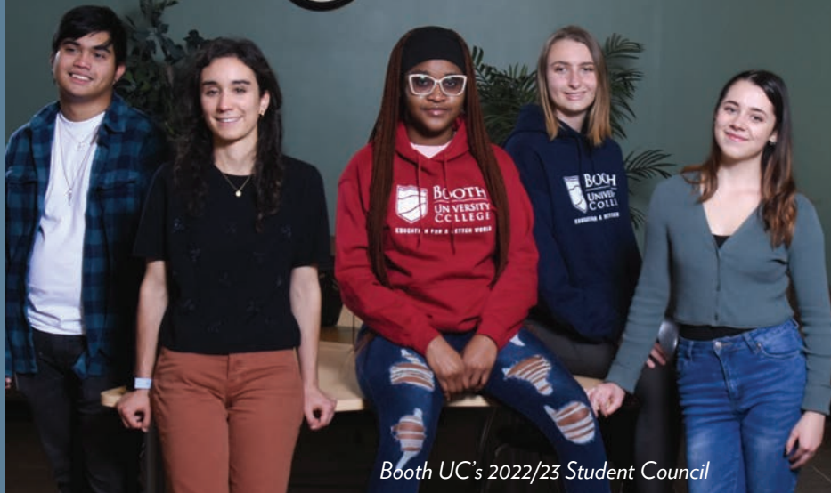
Booth UC's 2022/23 Student Council